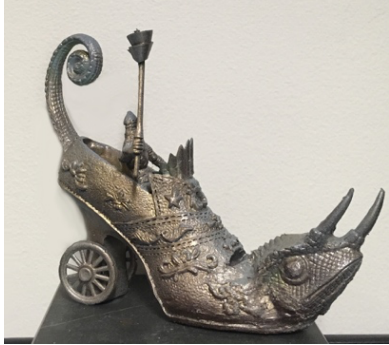
Shoe horn 1, $225 Mixed media assemblage

Vintage shoe is reimagined as an animate object with mechanical elements and animal parts. Each shoe in series is endowed with different animal features.