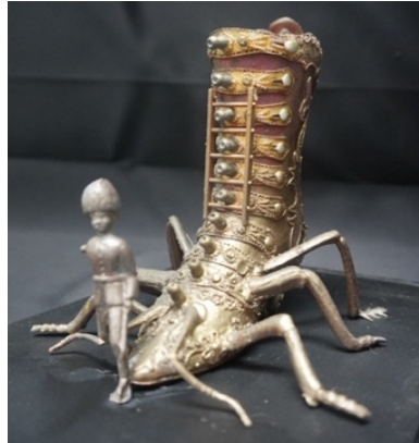
HMS combat boot, $250 Mixed media assemblage