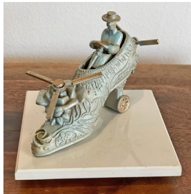
Propeller pump, $200 Mixed media assemblage