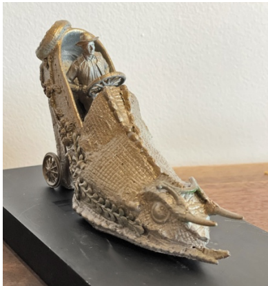
Shoe horn 2, $225 Mixed media assemblage