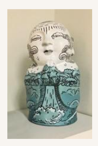
Terrestrial Monk, painted object