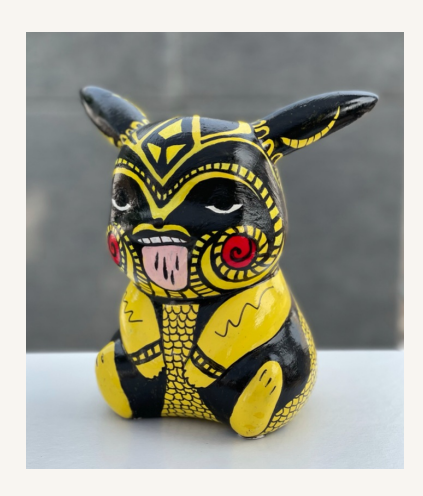
Pika Libre, painted object