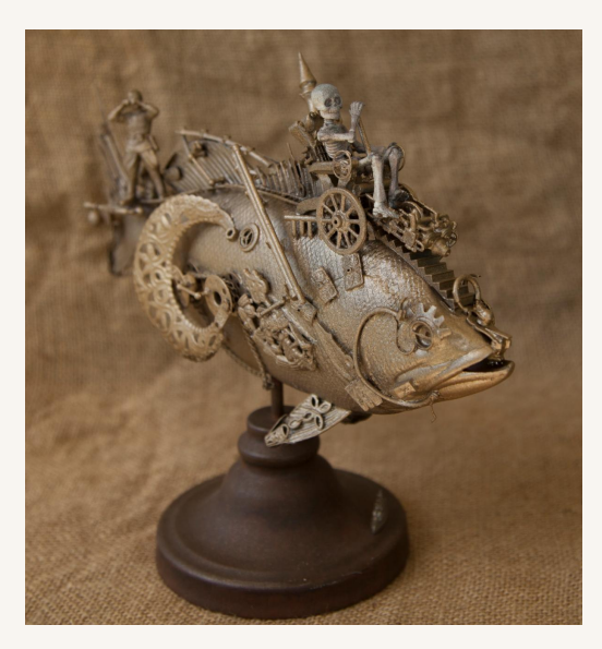
< Fish Tank, mixed media assemblage

Main Street Gallery artists are planning an "Emerging and Established Artists Show" for the month of April. The show will kick off with an opening night reception on April 2, followed by artist talks and demonstrations.