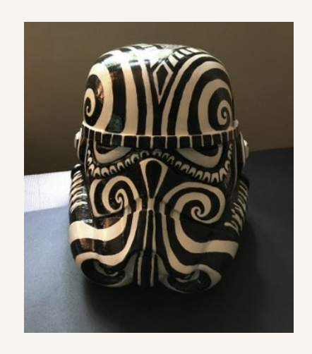
Avian Trooper, painted object

Large crowds turned out in December to attend the opening of the Doylestown Farmer's Market at the Mercantile. The Farmer's Market will be open between 10 AM and 1 PM on the first and third Saturday in February. Stop by to see my new art space and sample wares from Doylestown's local growers and makers.