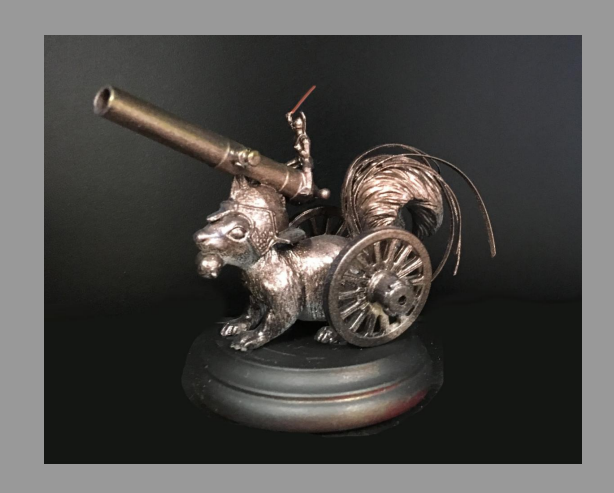
Battle Squirrel, mixed-media assemblage

FEBRUARY 19 10 AM - 1 PM Doylestown Famers Market at Mercantile