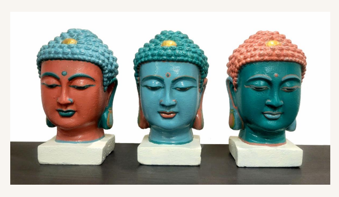
^Three Buddhas, painted objects