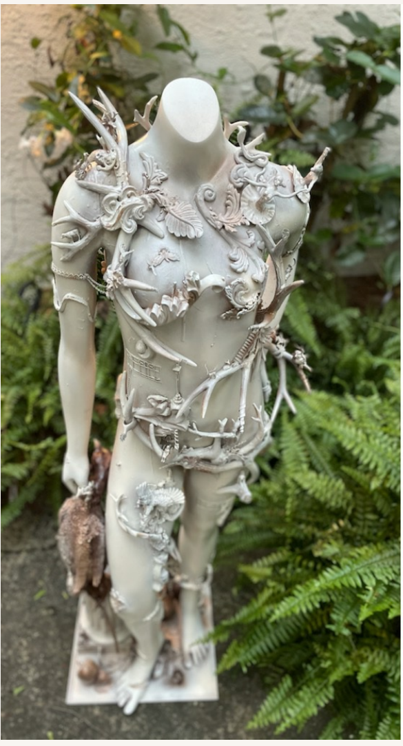
Not for Sale, mixed media assemblage